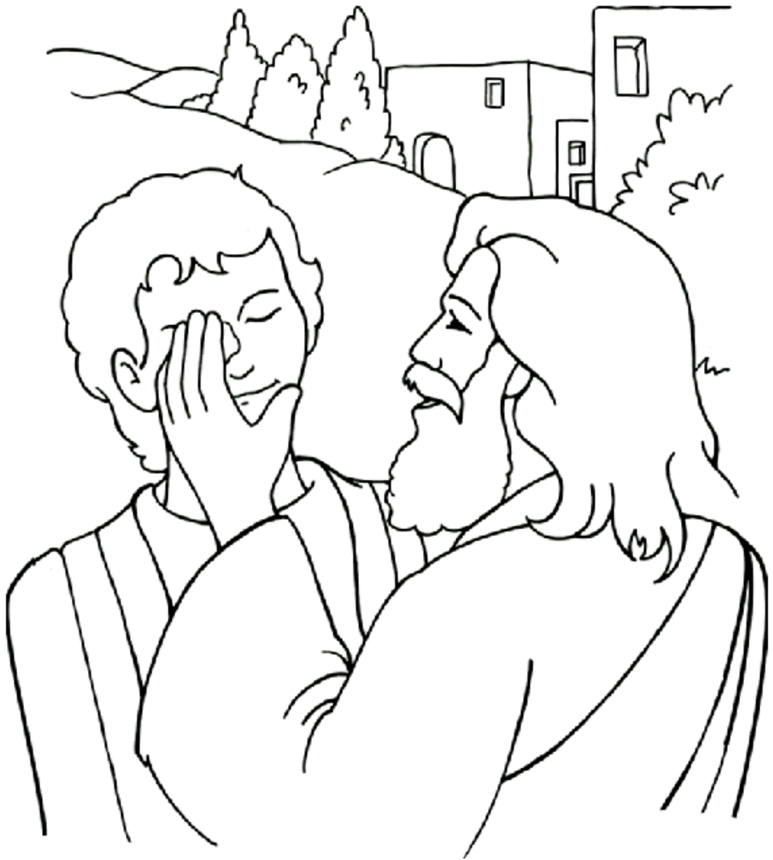
Jesus Heals a Man Born Blind John 9